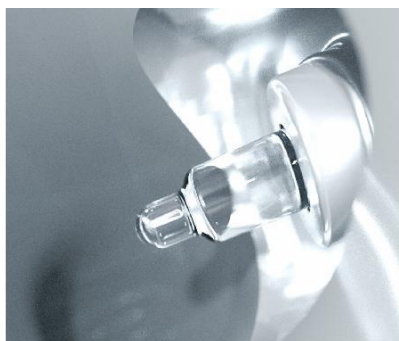
EXstatic - installation situation from inside