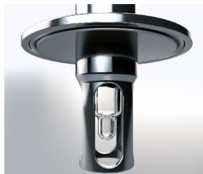
Version with protective cage