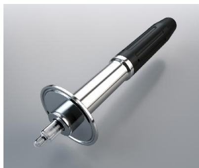
EXstatic 311 - version without protective cage